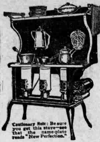
Cautious Note: Be sure you get this stove—see that the name-plate reads "New Perfection."