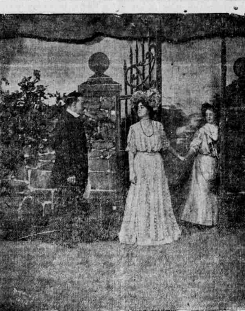
Scene from "A House of a Thousand Candles," at the Oregon Wed. Feb. 2.