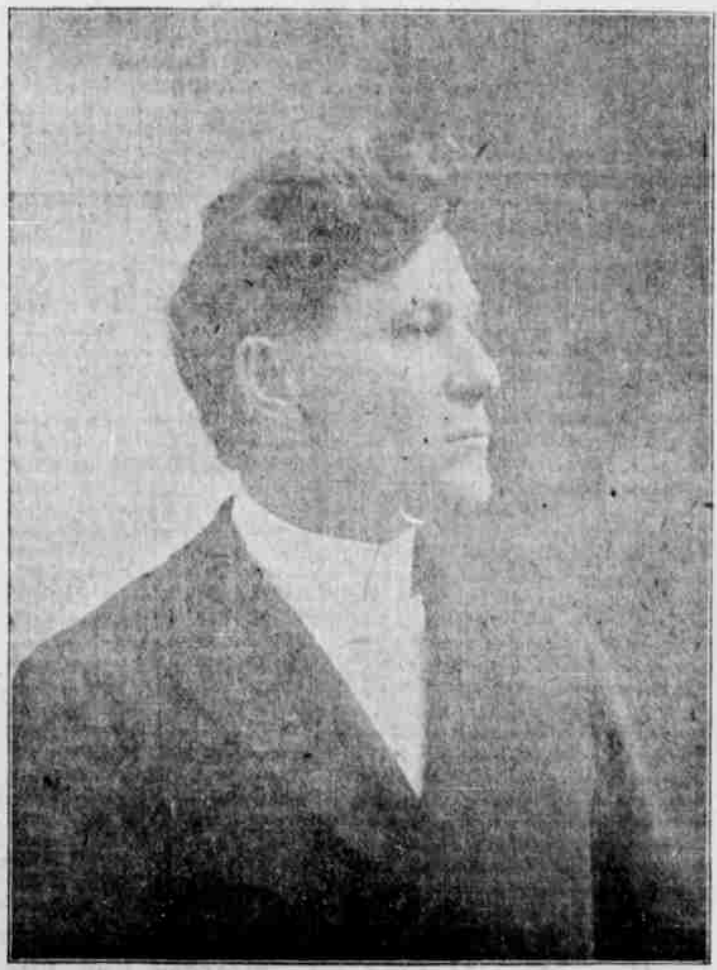
Evangelist at the Baptist Church This Week.