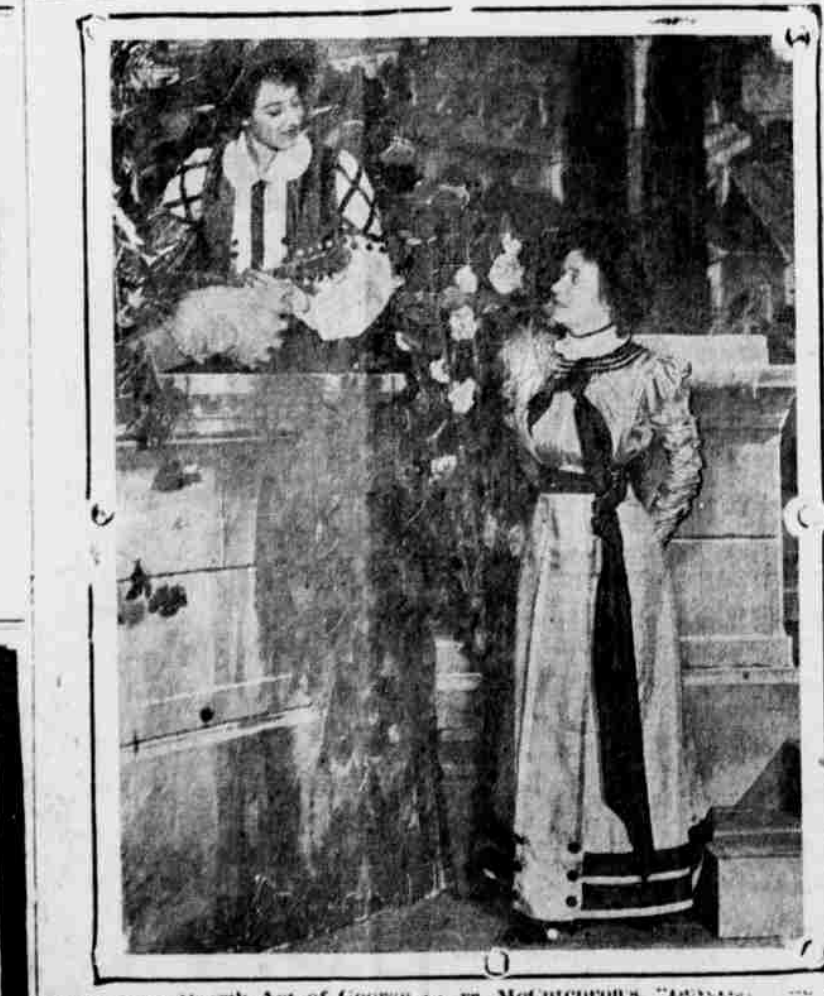
Scene from Fourth Act of George Barr McCutcheon's "Graustark," at the Oregon Theatre Tuesday, February 1.