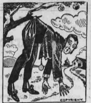
IF YOU'RE IN SUSPENSE

Daily East Oregonian, by carrier, 15 cents per week.