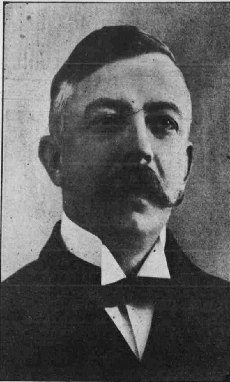
HON. H. M. CAKE STATEMENT NO. 1 REPUBLICAN NOMINEE FOR UNITED STATES SENATOR