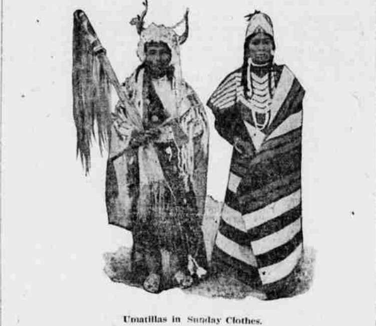
Umattilas in Sunday Clothes.