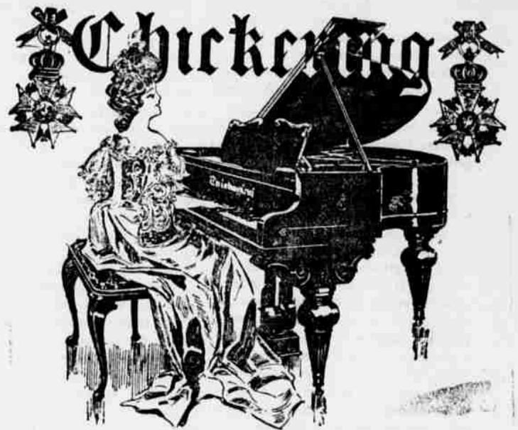
SECOND PRIZE. $500 Famous Chickering Quarter Grand Piano.