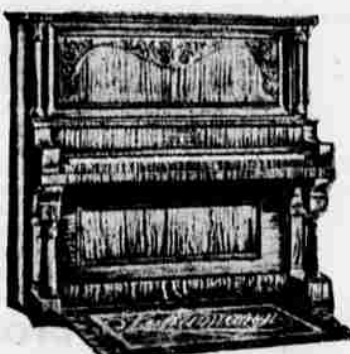
FOURTH PRIZE. $550 Fancy Exhibition Style Schumann Piano.