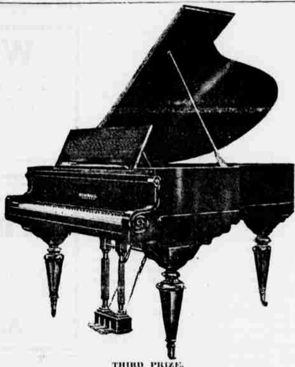
THIRD PRIZE. $400 Kimball Baby Grand Piano.

During the year just closed the total sales of Eilers Piano House exceeded the one and a half million-dollar mark, an increase of 50 per cent over the preceding year. During 1936 we want to reach the grand total of $2,500,000 in sales, and to this end we have set aside beforehand 1 per cent (1 cent of every dollar) of this anticipated business for the purpose of bringing to the attention of every home, old and new, throughout the Northwest the name of "Eilers Pianos." In other words, when you think "Pianos," "Good Pianos and Reliability," think "Eilers," and again when you think "Eilers" make it synonymous with "Good Pianos and Reliability."