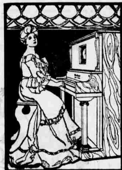
FIRST PRIZE. $800 Weber Metrostyle Pianola Piano.