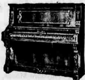
FIFTH PRIZE. $550 Fancy Mahogany Marshall & Wendell Upright Piano.

Eilers Piano House offers costly prizes in remarkable word contest. Prizes to be given those who send the largest list of correct words made from letters used in spelling the two words!