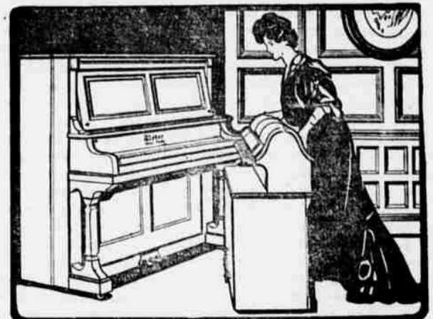
SIXTH PRIZE. $250 Latest Metrostyle Pianola.