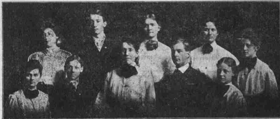
Pendleton Graduating Class, '05.