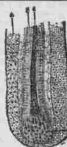
A Healthy Hair.

The curative effect of Herpicide is sometimes little short of marvelous, for after the dandruff germ is destroyed, and kept out of the scalp, the hair is bound to grow as nature intended. It stops itching of the scalp almost instantly.