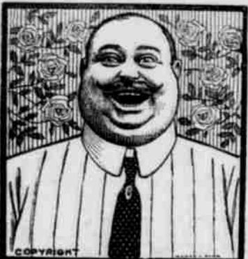
THE SMILE OF SOLID SATISFACTION.

The City Brewery Bottled Beer. The greatest summer drink. It goes right to the spot. Always have this superior beer in your home. It gives youth and vigor to your tired system. Physicians recommend beer that is pure. City Brewery Bottle Beer is always good and always the same. It is made in Pendleton and not subject to changes of temperature in being shipped. Put up in quarts, pints and half pints, and delivered in any quantity desired. Bottling Works telephone 1771. Residence telephone 1831.