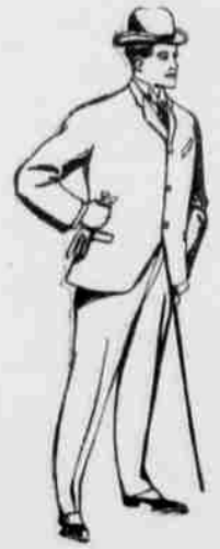
INTRODUCTORY INDUCEMENT NO. 4.

As a special inducement we will sell these suits for $15.00. They are worth $17.50 and $18.00, and will give the purchaser absolutely free, his choice of any $3.00 hat or suit case in the house.