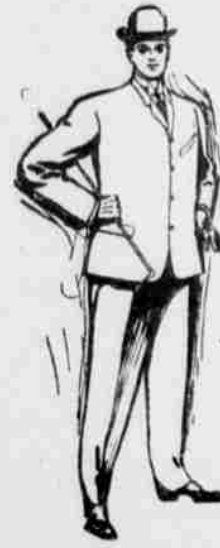
INTRODUCTORY INDUCEMENT NO. 3.

As a special introductory inducement we will sell them for $20, and give the purchaser, absolutely free, his choice of any $3.50 hat or suit case in the house.