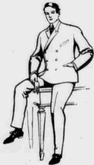
INTRODUCTORY INDUCEMENT NO. 1.

INTRODUCTORY SALE OFFERS—REALIZING THAT WE HAVE GOT TO USE EXTRA EFFORTS TO DRAW THE TRADE TO OUR NEW LOCATION WE HAVE MADE THE SPECIAL INDUCEMENTS BELOW: