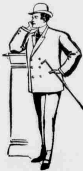
INTRODUCTORY INDUCEMENT No. 2.

As a special inducement we will give purchasers absolutely free, a $5.00 suit case.