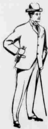
INTRODUCTORY INDUCEMENT NO. 4.

As a special inducement we will sell these suits for $15.00. They are worth $17.50 and $18.00, and will give the purchaser absolutely free, his choice of any $3.00 hat or suit case in the house.