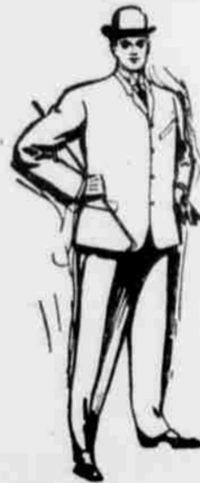
INTRODUCTORY INDUCEMENT NO. 3.

As a special introductory inducement we will sell them for $20, and give the purchaser, absolutely free, his choice of any $3.50 hat or suit case in the house.