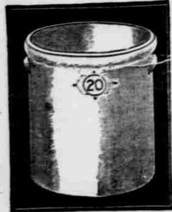
All size jars, crocks, jugs, churns, etc.

We will make the price satisfactory. See us.