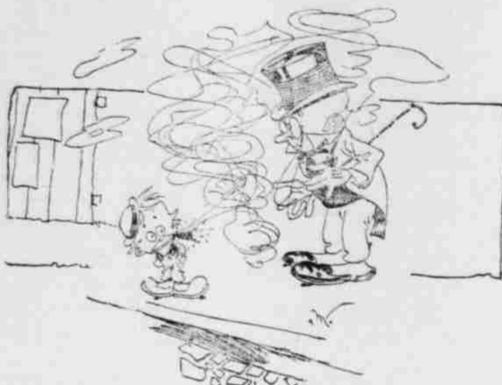
Mr. Goode—Gracious! Where did yo get that cigar? Muggsy—Dis is a special brand wot I has made for me.