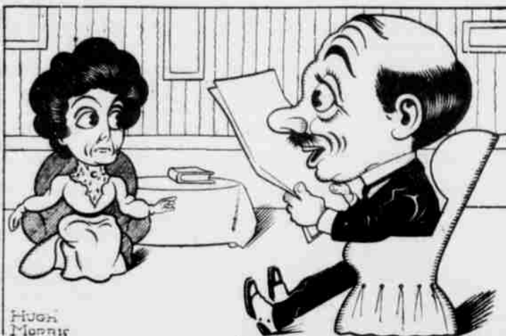
Cheapest Way. Mrs. Holdtite—Dr. Kurem' Awl says I must spend six months in Europe. What shall I do? Mr. Holdtite—Get another doctor.