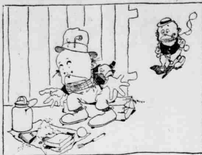
"Be dad! O've spilt me salt! That's bad luck unless —"