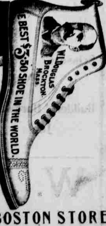
BEST $3.50 SHOE IN THE WORLD.

The sun has not set on the day since September 1st that has not witnessed the arrival of new goods at the Peoples Warehouse. This week we have ladies' neckwear, belts, golf gloves, handkerchiefs, automobile bags, beads and looms.