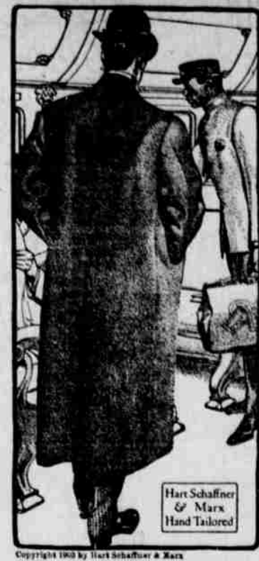
Hart Schaffner & Marx Hand Tailored

General Daniel Sickles, who is 78 years old, has been nominated for alderman in Greater New York, by the fusionists.