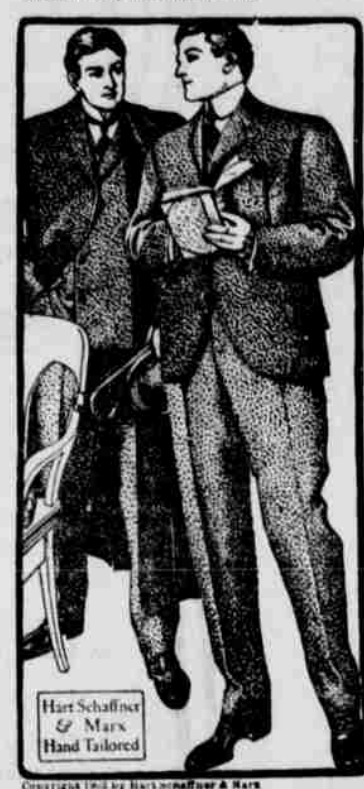
Hart Schaffner & Marx Hand Tailored