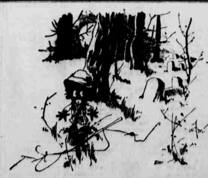
Little Moss-Lawdy! Ef I see no sap at I feels, I mus' look lak a white boy!

Three trusty patients at the state insane asylum left the asylum farm Saturday and no trace of them has yet been found.