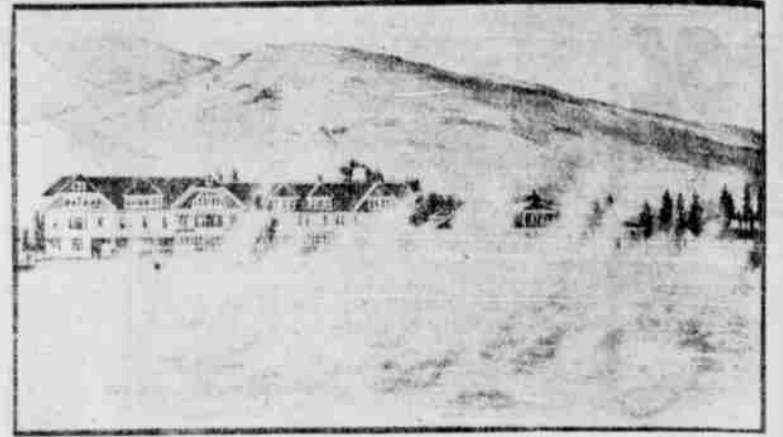
Steam Arising From Hot Lake--View of Sanatorium, Hot Lake, Oregon--Altitude 3,000 Ft.

Many Acres of Hottest Spring Water on Earth—Marvelously Curative