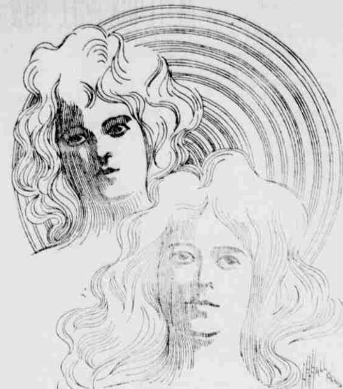
"She knows where her husband is every minute of the day." "He must be in the penitentiary."

A POSITIVE CURE For Inflammation or Catarrh of the Bladder and Discharge of Urine. No cure no pay. Cures quickly and permanently the worst cases of Gonorrhoea and Gleet, no matter of how long standing. Absolutely harmless. Sold by druggists. Price $1.00, or by mail, postpaid, $1.00, 3 boxes, $2.75. THE SANTAL-PEPSIN CO., BELLEFONTAINE, OHIO. Sold by F. W. Schmidt & Co.