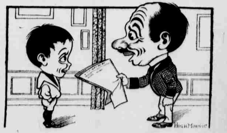
Bobby—Say, pop, what is a safe wager? Pop—The one you were going to make, but didn't.