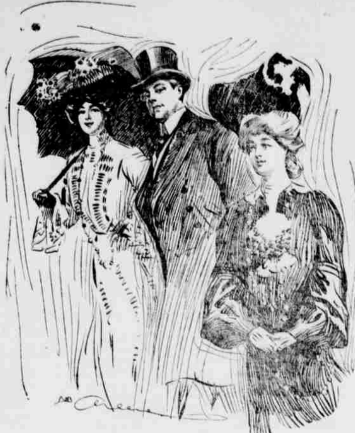
THE POWERS THAT BE. "Did you know the French Ambassador and the German Envoy were both married to American women?"