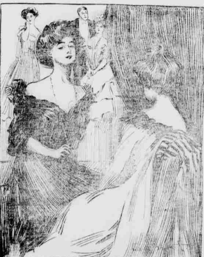
"That fellow literally lives from hand to mouth." "Some struggling poet, I suppose." "No, he's a dentist."

(ELATERITE is Mineral Rubber.) YOU MAY INTEND BUILDING or find it necessary to REPLACE A WORN-OUT ROOF ELATERITE ROOFING Takes the place of shingles, tin, iron, tar and gravel, and all prepared roofings. For flat and steep surfaces, gutters, valleys, etc. Easy to lay. Tempered for all climates. Reasonable in cost. Sold on merit. Guaranteed. It will pay to ask for prices and information. THE ELATERITE ROOFING CO. Worcester Building, Portland.