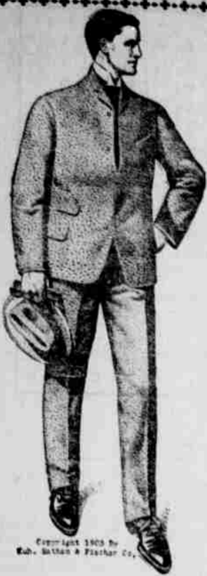
Harvard Sack

is your own fault you dont know it. The best ten Dollar suit on earth.