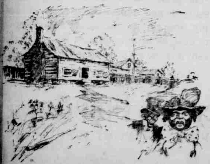
Mr. Johnson—Was you evah in a fight, Mistah Jackson? Mr. Jackson—Yo' seems to disremember dat I'm a widower, Miss Johnnie.

LEGAL BLANKS Write the East Oreg- onian for a free cat- alogue of them. A full supply always kept in stock.