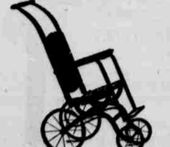
These handy little carriages can be folded and stand in a space of 16 inches. $4.45, $4.85

THE NOLF STORE Money refunded if goods prove unsatisfactory