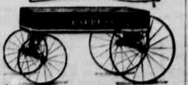
Boy's Iron Wagon—the kind for hard service, at 98c, $1.35, $1.95, $2.25, $2.45

New Arrivals:—Full line of Ellis Wheeler Wilcox's books and a full line of President Roosevelt's books.