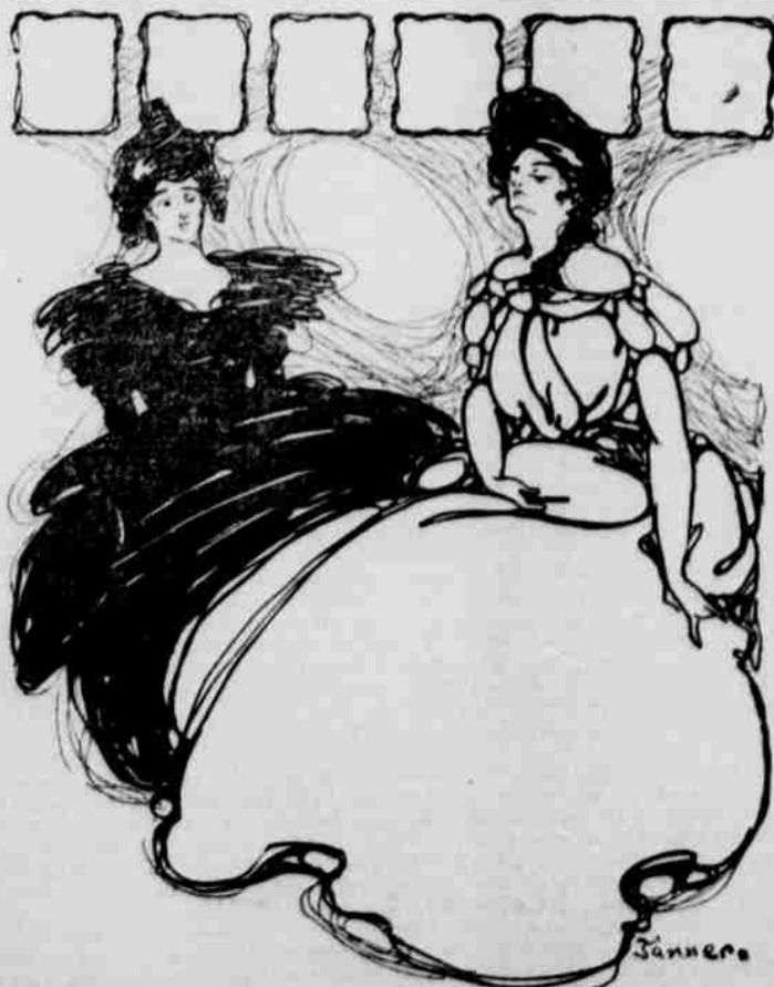
A HOT ONE.

Thompson Hardware Co., 621 Main St. Headquarters for Fishing Supplies.