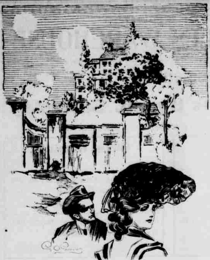
"Would you slap me if I kissed you?" "I would if I didn't have such an awfully sore finger."