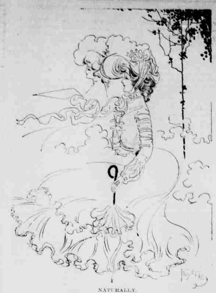
NATURALLY. "Who was the best man at the wedding?" "The preacher."

FOR SALE. FOR SALE AT A BARGAIN—A SIX-ROOM house with bath, porch, and cellar; two acres of ground; just water; Hazel street, West Pendleton. Inquire of J. F. Earl, or of Fred Earl at Peoples warehouse. FOR SALE—LODGING HOUSE. SEE SPOONE more and Brummett, 239 E. Court St.