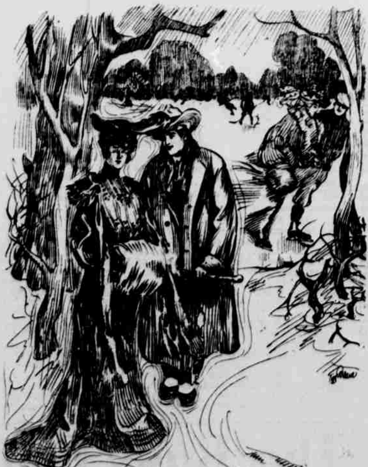
She—How is it you never hear of a woman absconding? He—Women don't have extravagant wives.

WANTED ADVERTISERS TO MAKE USE of these classified columns. If you have something you have no use for, offer to trade it for something that some other body may have and have no use for, some- thing that you may need in your business. You may have an extra horse that you may wish to trade for a cow or a vehicle. Somebody may have the cow and vehicle and want the horse. 15c or 25c want ad will probably do the business.