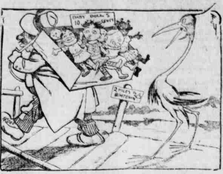
Here's a tip—buy good, that means—