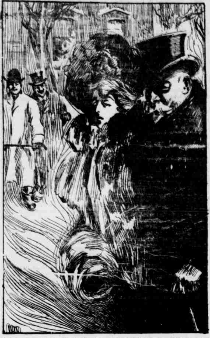
"There's one thing I like about our new minister; he doesn't jump at conclusions. No; it usually takes him about an hour to reach a conclusion."