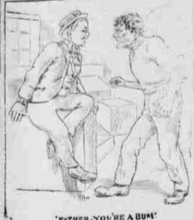
"WATER, YOU'RE A BUM!"

"A Gambler's Daughter." "A Gambler's Daughter" is the title of a play that has scored a success this season unprecedented in recent years, and it is to be given here in all its entirety by the original company which first carried it on to prosperity and popularity. It will be produced next Monday, Feb. 2, at the Frazer and it is certain to play to packed houses. "A Gambler's Daughter" is a sensational melo-drama. There is much of a tragic nature in it that excites to an intense pitch the emotions of the spectators, but all ends happily and the lovers after many adventures, and after foiling the dire conspiracies against them by black-hearted villains are finally united. The play is also enlivened by excellent comedy, and when the spectators are not in tears over the misfortunes of the beautiful heroine and the shadows that appear to threaten her future, they are laughing and applauding uproariously at the funny antics and comical sayings of the comedian and comedienne.