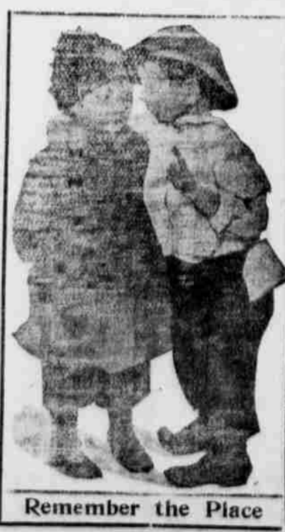
Remember the Place