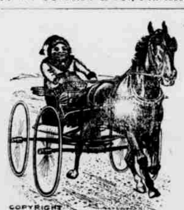
When Kris Kringle Holds the Reins

They are curing Bright's Disease and Diabetes in California. The percentage of efficiency (recoveries) in these hitherto incurable diseases average as high as 87 per cent. The details of the investigation and demonstration of the new compounds are so conclusive that we at once sent or a bundle of the reports and for the new treatment for urgent cases in this city. Call or send for one of