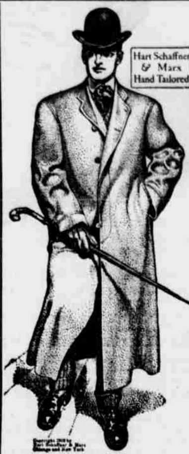
Hart Schaffner & Marx Hand Tailored

OVERCOATS—$6.00, $7.50, $10, $15, $16.50, $17.50, $20, $22.50, $25 and $30