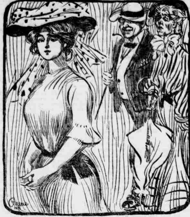
Mrs. Oldwood—Her face would stop an automobile. Mr. Oldwood—If I had one, I'd stop it for her any day in the week.