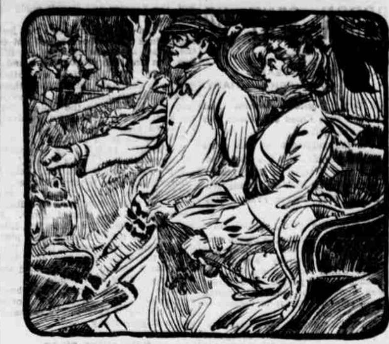
AUTO HONORS. "Have you been awarded any blue ribbons in these speed contests?"