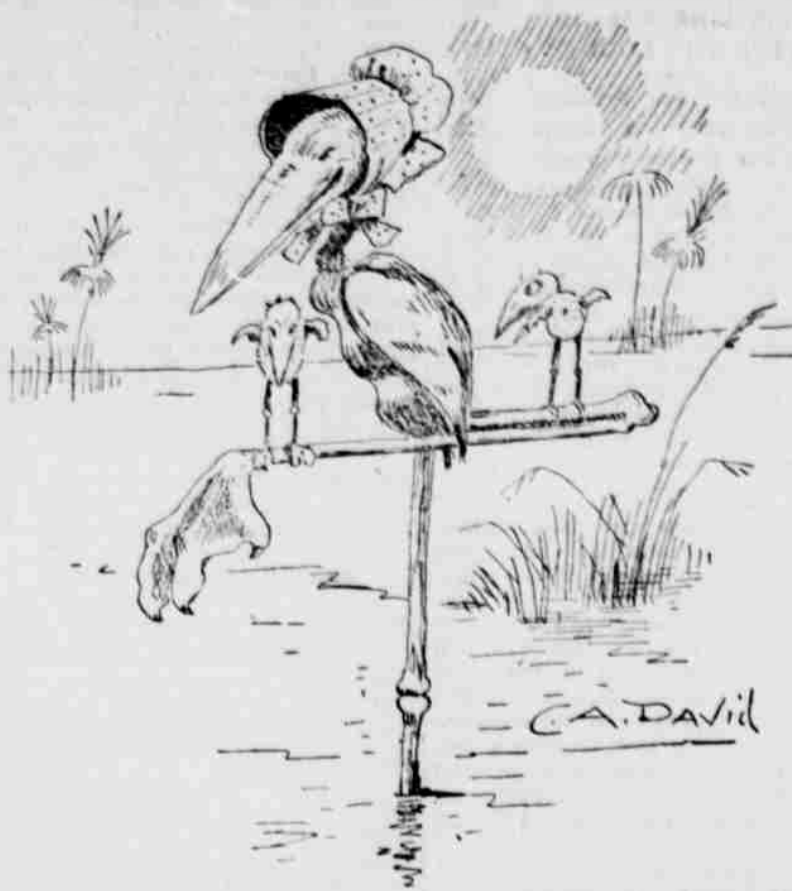
Young Stork—Mama, don't forget and change feet during the night.