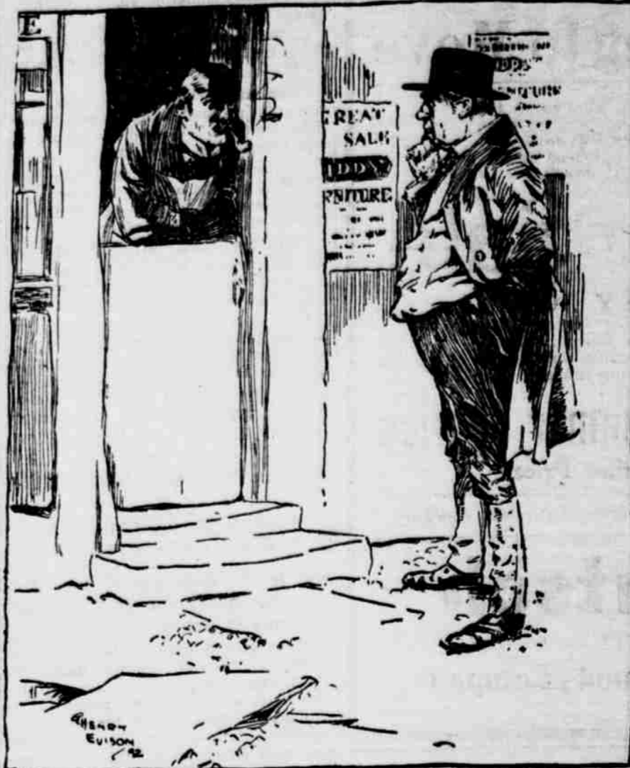
Prospective Customer: 'Have you got a mattress for sale?' Attendant: 'Yes, sir. A spring mattress?' Prospective Customer: 'No; I want one as'll do all the year round.'