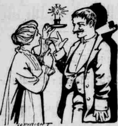
We See Our Finish

Colesworthy AT THE CHOP MILL 127 and 129 East Alta Street