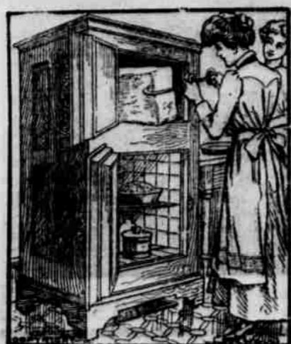
Telephone Main 105.