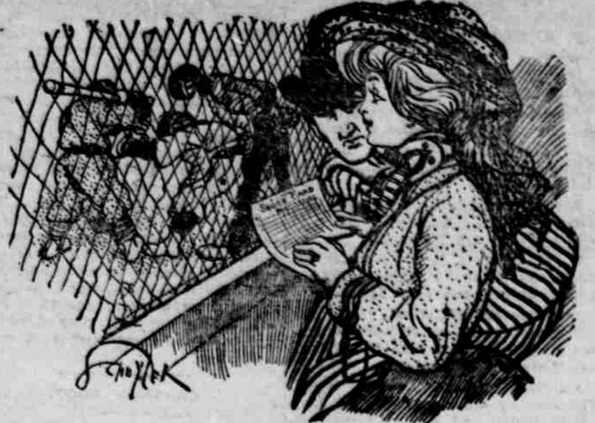
NO HIGH BALLS. Fair Spectator—Is Umpire Genuinely a good judge of balls? Her Escort (absently)—Never drinks a drop.

WAGON FEED YARD, W. T. BOWEN prop. Special care given to horses left in care. Lower Webb Street. Phone Red