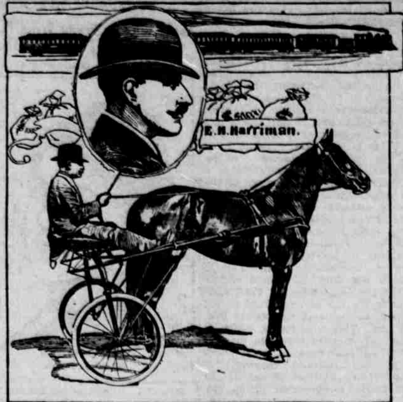
RAILROAD KING HARRIMAN AS A HORSE TRAINER. E. H. Harriman, the man who fought J. P. Morgan for the control of Northern Pacific, is one of the most powerful railroad men in America. He is a scientist and trainer of trotters when not busy in Wall street.

LEGAL BLANKS Write the East Oregonian for a free catalogue of them. A full supply always kept in stock.