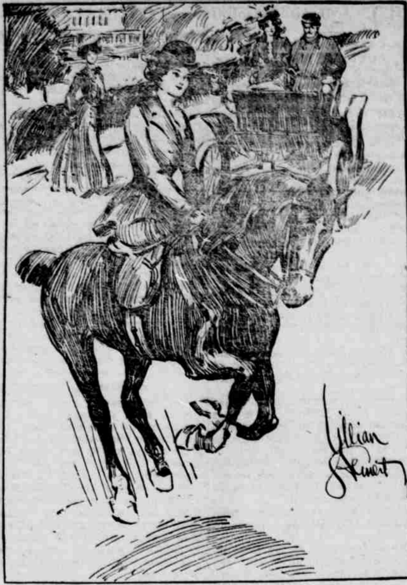
"If you love her as you say you do why don't you sail in and win her?" "Afraid I couldn't raise the wind."