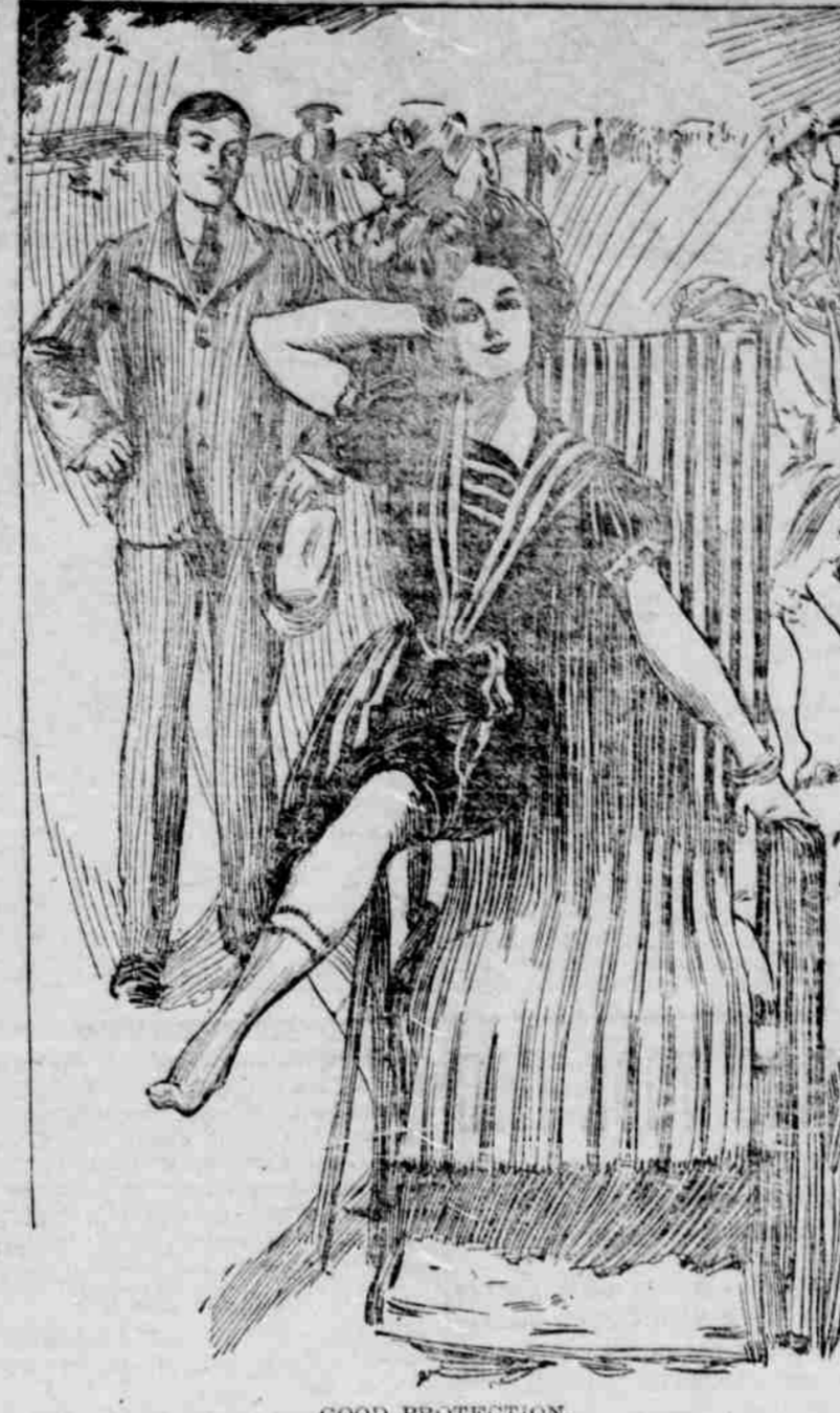
"Mama," said the fair bather, "declares that my bathing dress has not brought goods in it." "Your mama is mistaken," asserted the young man; "it covers your shoulders completely, does it not?"