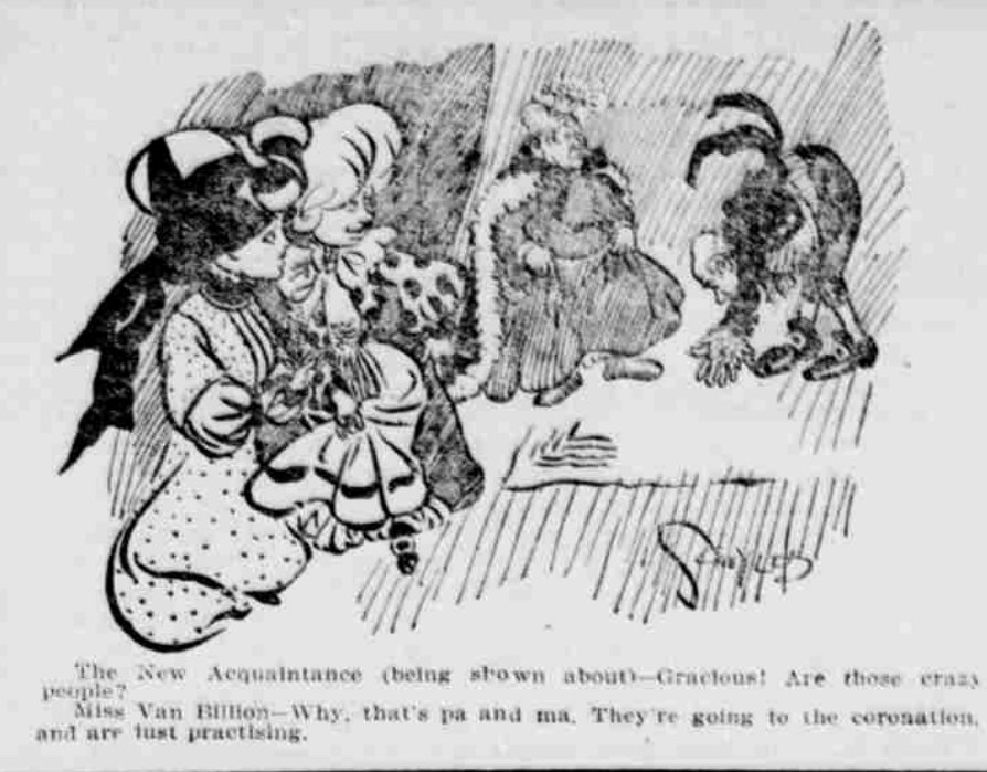
The New Acquaintance (being shown about)—Gracious! Are those crazy people? Miss Van Billion—Why, that's pa and ma. They're going to the coronation, and are just practising.