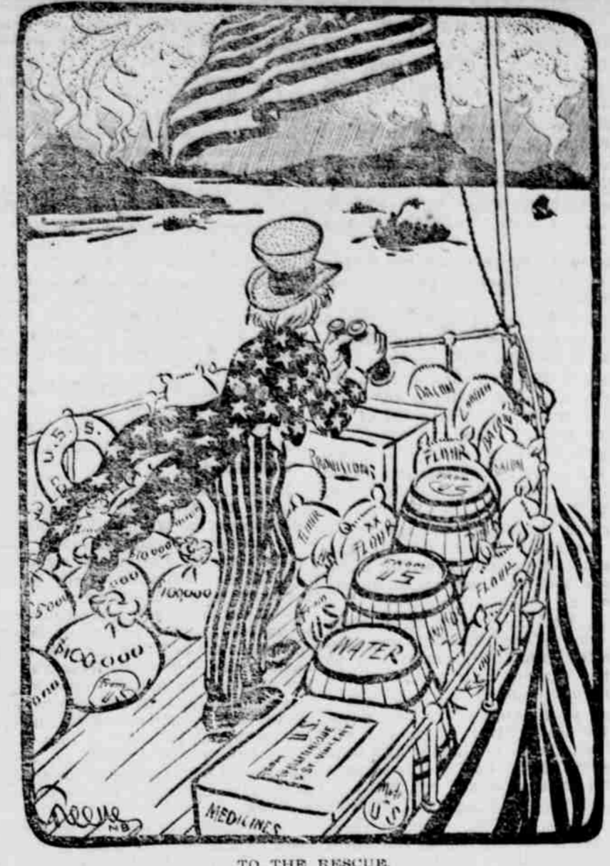
TO THE RESCUE.