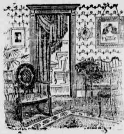
In Parlor Furniture we have an exceptionally fine line of couches, rockers and odd pieces from which to select.