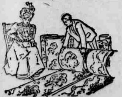
Carpets from 30c up. Excellent and large assortment Ingrain, Tapestry, Velvet, Axminster, etc. Handsome patterns that keep their color and have the wear in them.

THAT'S the kind that Rader keeps, and no matter what you desire in the line of furniture or carpets you will always get satisfaction if you select from our large stock, which includes more pieces and a bigger variety than can be found anywhere in Eastern Oregon. In buying furniture we select with the object of supplying the public with the newest creations, the most substantial made and finest polished and finished there is to be had. The main point we have in view is to give real, genuine bargains in every purchase made of us, no matter how large or small. We buy direct from manufacturers in large quantities, and for cash, which gives us the very lowest prices, and we are satisfied with a small margin, which sums up the main points of the low prices we offer on superior goods.