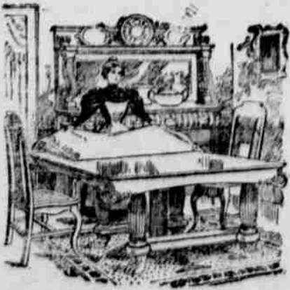
Dining Room Furniture. Ornamental and useful. Here's where we shine. Chairs 65 cents and up. Extension Tables $5.00 and up. Sideboards and buffets—a line of beauties.