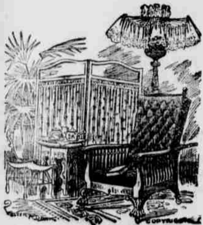
The Morris Adjustable Back Chair. Affords solid comfort. Can be set to your liking. Handsomely upholstered and finished, only $5 95