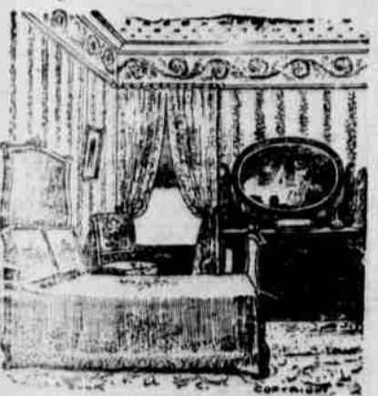
Just the right ideas for your bed rooms. Bedsteads $2.00 and up. Suites at correspondingly low prices.