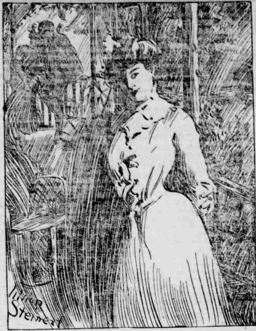
THE LANDING PLACE.

YOU CAN GET THE HIGHEST MARKET price for your pelts, hides and all kinds of junk, such as rubber, brass, copper, lead, zinc, rags and bottles. Iron of all kinds a specialty. You can bring in 50 cents worth of hides or rags or ship in $500 worth of hides and will be treated in the same way. We have come here to stay. Give us a call and you will be satisfied. L. Shank & Co., office and warehouse next to Eastern Hotel, Pendleton, Oregon. Telephone, Red 221.